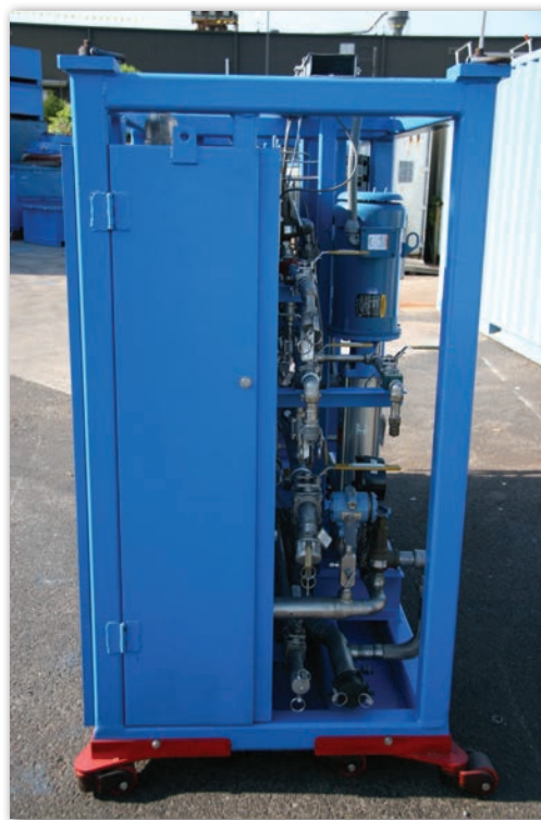
Side view of RWRO™ skid with integrated shielding and hinged shield doors for easy access to housings for membrane changeout.