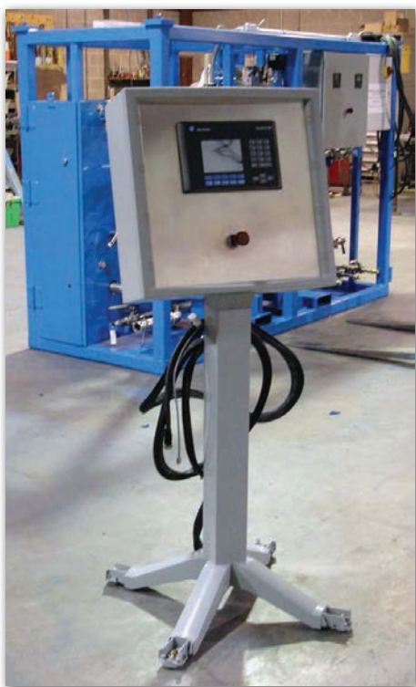
Stand-alone pedestal with Programmable Logic Control (PLC) touch screen controls permits easy, remote operation.

Membranes last 3-5 years, which is typical of LRW installations. Because the RWRO™ is so reliable and eliminates the need for reprocessing, one technician can process all the plant's LRW water.